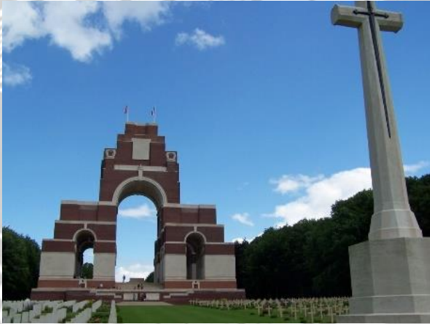
(Thiepval Memorial, France)